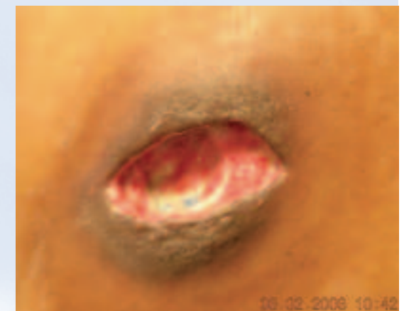
6-02-2006 Wound after 10 days of treatment.