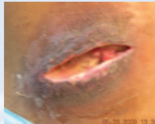
5-23-2006 Wound prior to treatment.

Sponsored by: Hydrofera ® Pioneering Advancements in PVA Technology