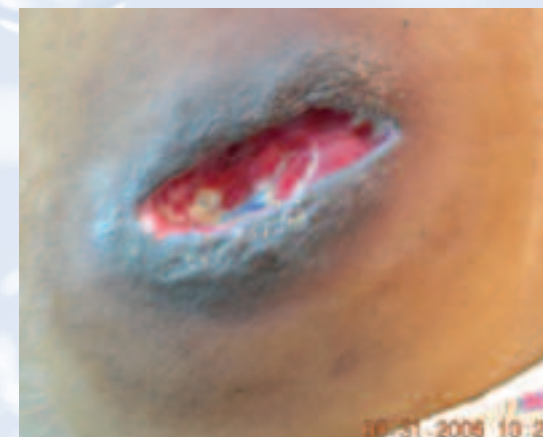
5-31-2006 Wound after 8 days of treatment.