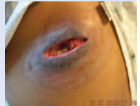
5-25-2006 Wound after 2 days of treatment.