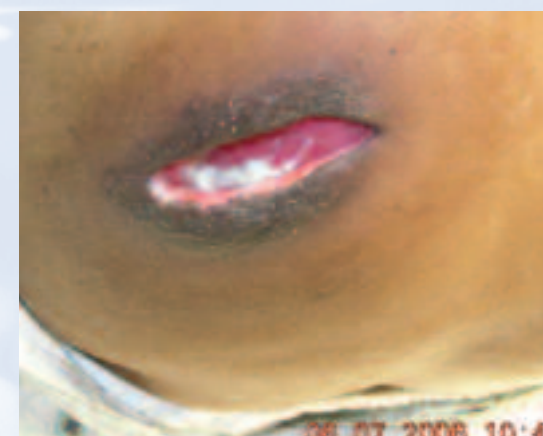
6-07-2006 Wound after 15 days of treatment.