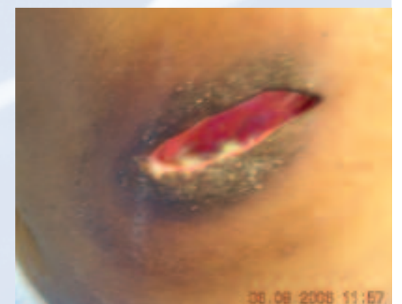
6-08-2006 Wound after 16 days of treatment.