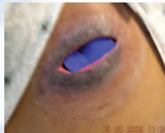
5-25-2006 Hydrofera Blue inserted into wound.