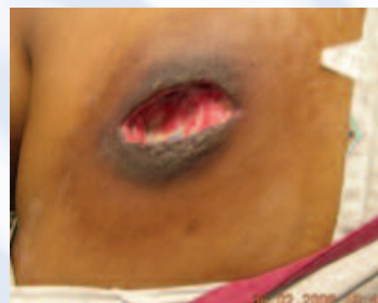
6-02-2006 Wound after 10 days of treatment.