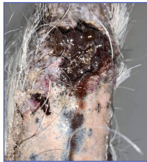
1/16 Necrosis at mid-tail