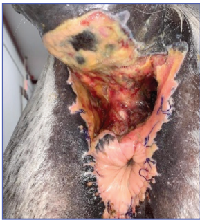
1/14 Excision of melanoma