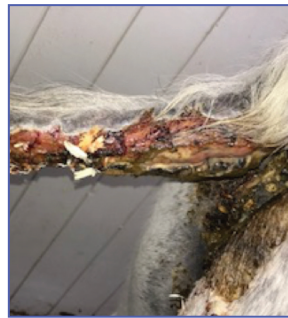
2/21 Tail fully necrosed and infected