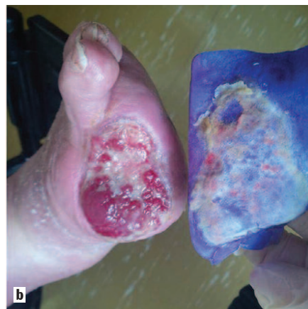
Figure 1b. Site after two weeks of treatment with a GV/MB dressing. Note the removal of slough and devitalized tissue by the dressing.