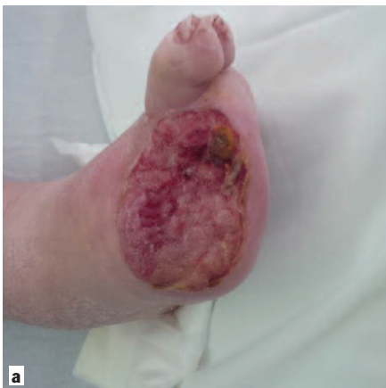
Figure 1a. Baseline presentation of an infected toe amputation site.

Chronic wounds are defined as wounds that do not heal in an orderly and predictable manner within six weeks. 26,27 Natural healing requires the host to mount a cellular response with proper migration of cells, thereby eliminating invading organisms or foreign